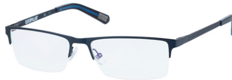
CTO-INSTALL-006 Matte navy / Gloss black and blue crystal