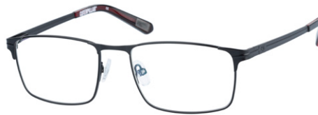
CTO-GAFFER-004 Matte black / Gloss black and red crystal