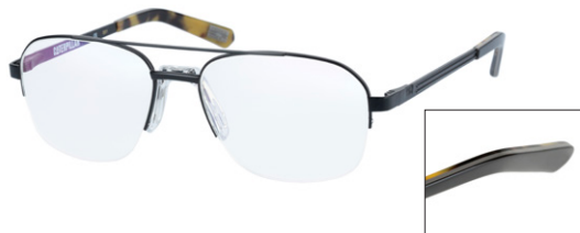
CTO-BRIDGER-004 Matte black / Matte black tort