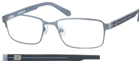
CTO-MILLWRIGHT-005 Matte gun / Matte black and gloss grey