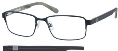
CTO-MILLWRIGHT-004 Rubberized matte black / Matte black and gloss olive