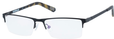
CTO-INSTALL-004 Matte black / Matte black tort