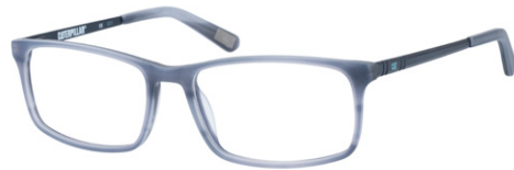
CTO-SCHEDULER-106 Matte blue / Matte navy horn