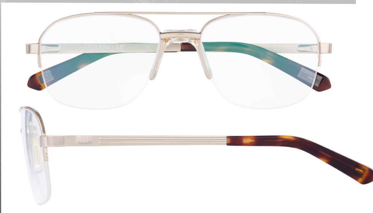
CTO-BRIDGER-001 Matte gold / Gloss tort