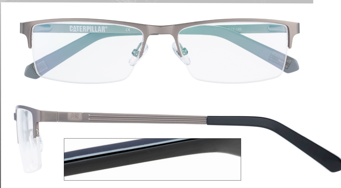
CTO-INSTALL-005 Rubberized matte gun / Gloss black, white and grey layered