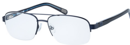
CTO-GLAZER-006 Matte navy / Gloss black and blue crystal