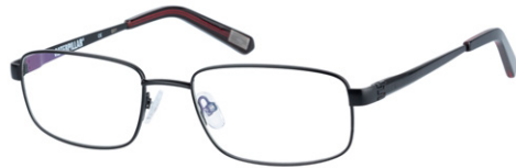
CTO-WELDER-004 Matte black / Gloss black and red crystal