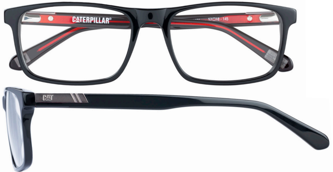
CTO-CONTROLLER-104 Gloss black / Gloss black and red crystal