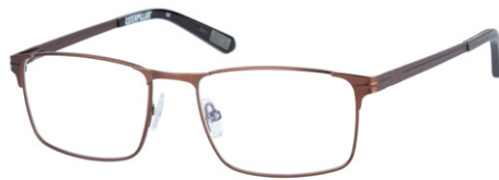
CTO-GAFFER-003 Matte brown / Matte brown carbon and gloss brown crystal