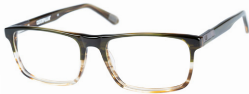
CTO-CONTROLLER-103 Gloss brown horn fade