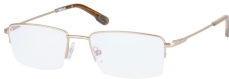
CTO-TINKER-001 Matte gold / Gloss brown horn