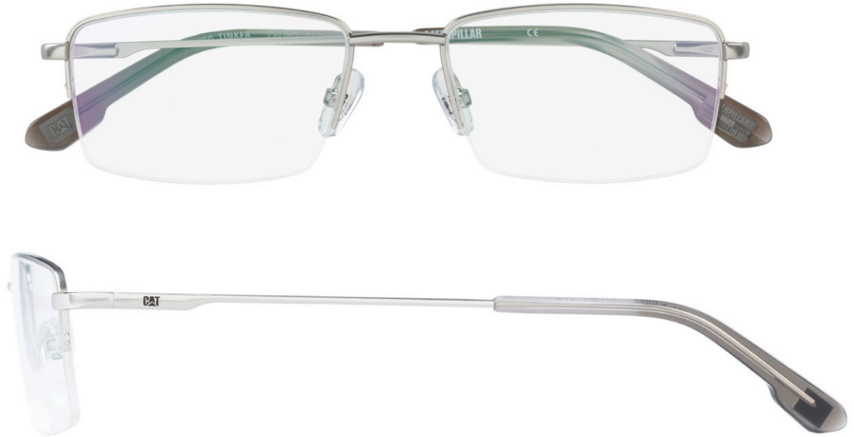
CTO-TINKER-002 Matte silver / Gloss grey horn