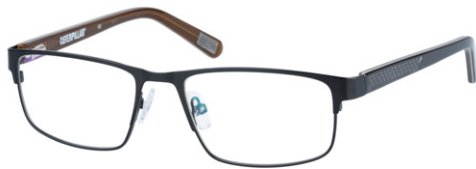
CTO-LAYER-004 Matte black / Gloss dark brown and light brown