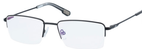
CTO-TINKER-004 Matte black / Matte black and crystal