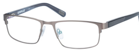
CTO-LAYER-005 Matte gun / Gloss black and grey horn