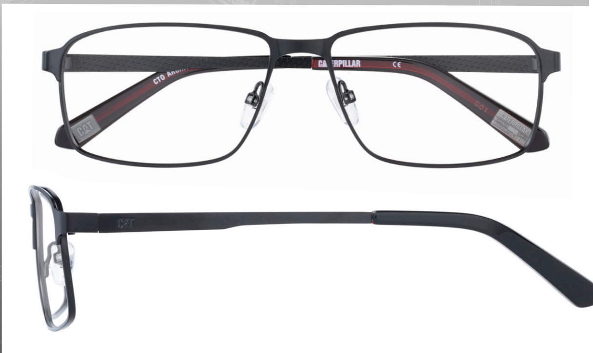
CTO-ARCHITECT-004 Matte black / Gloss black and red crystal