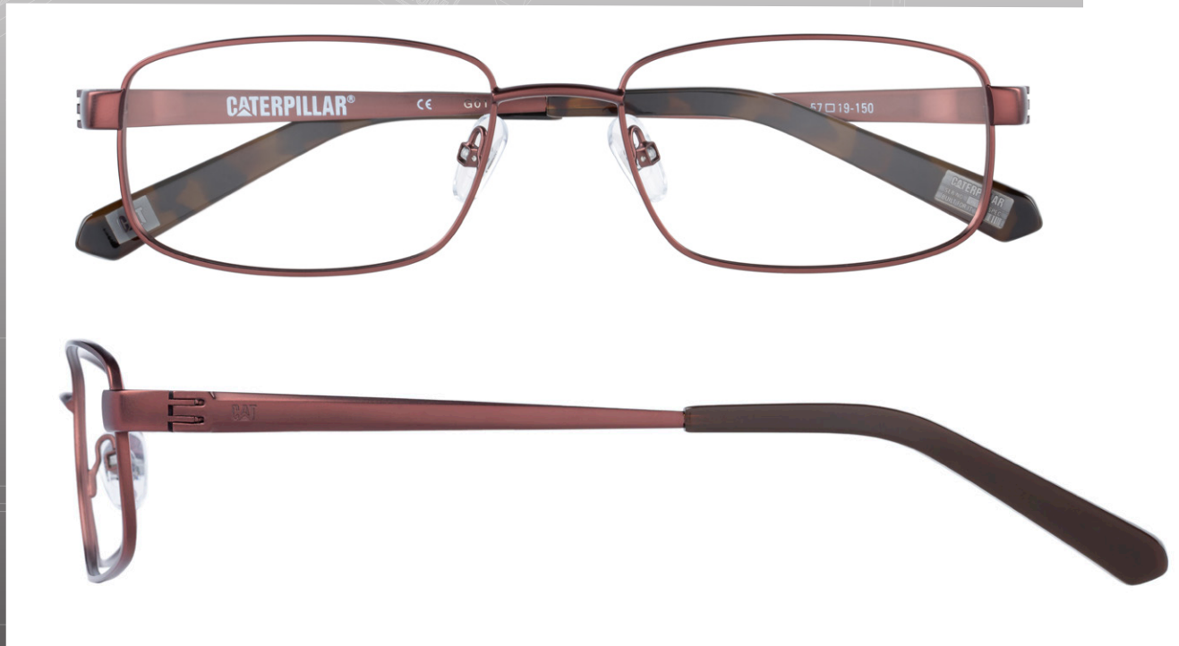
CTO-WELDER-003 Matte brown / Gloss brown and tort