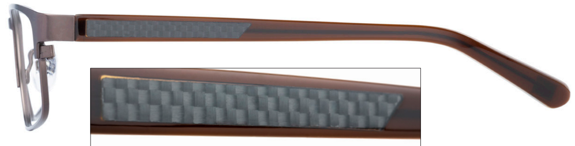
CTO-LAYER-003 Matte brown / Gloss dark brown and green