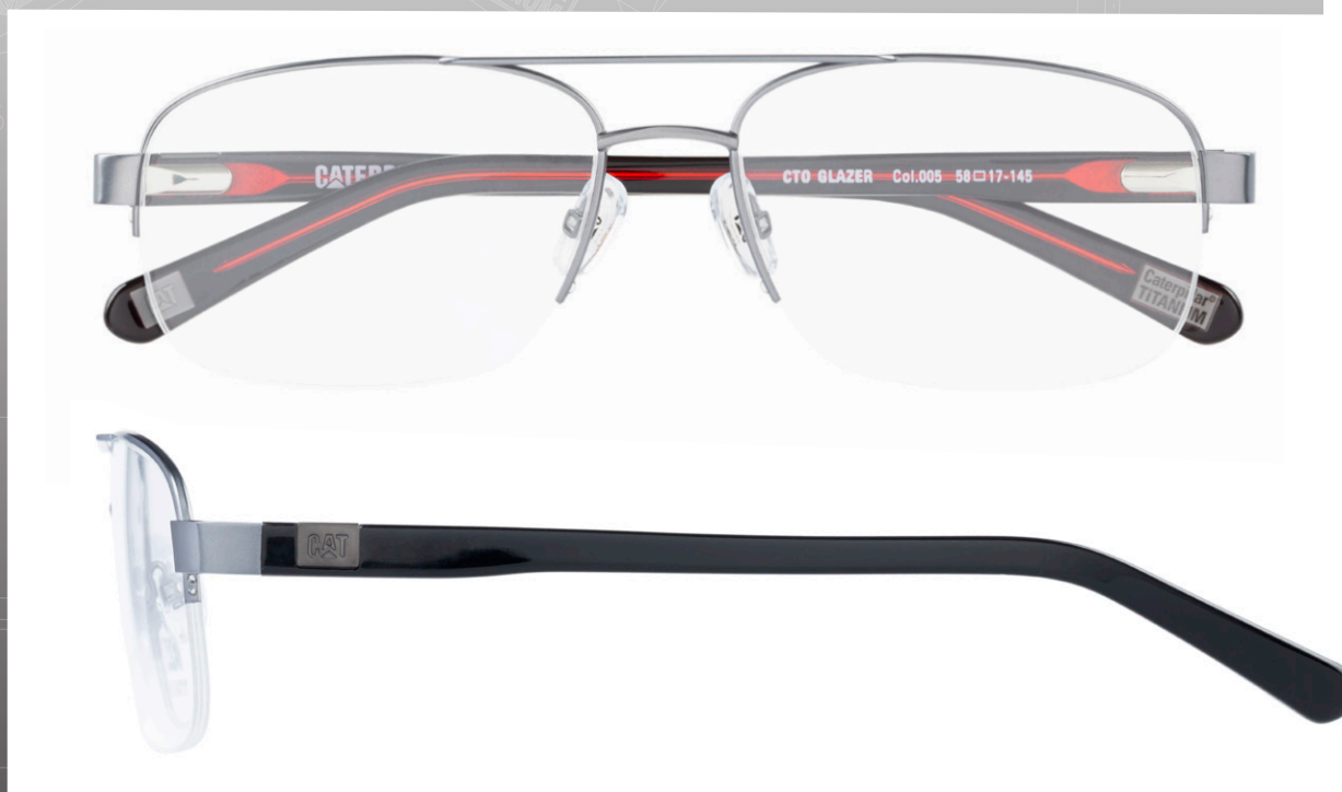
CTO-GLAZER-005 Matte gun / Gloss black and red crystal