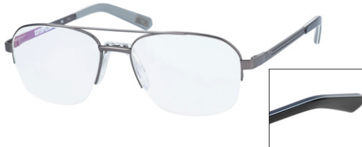
CTO-BRIDGER-005 Matte gun / Gloss black, white and grey layered