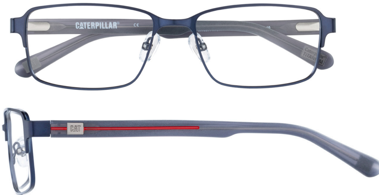
CTO-MILLWRIGHT-006 Matte navy / Matte navy horn