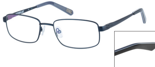
CTO-WELDER-006 Matte blue / Gloss black, white and grey layered