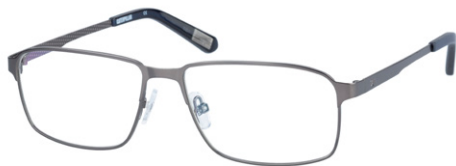
CTO-ARCHITECT-005 Matte gun / Matte blue carbon and gloss blue crystal