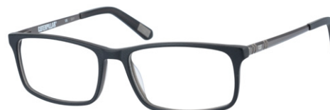
CTO-SCHEDULER-127 Matte carbon / Matte carbon