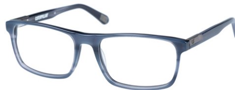
CTO-CONTROLLER-106 Gloss navy horn