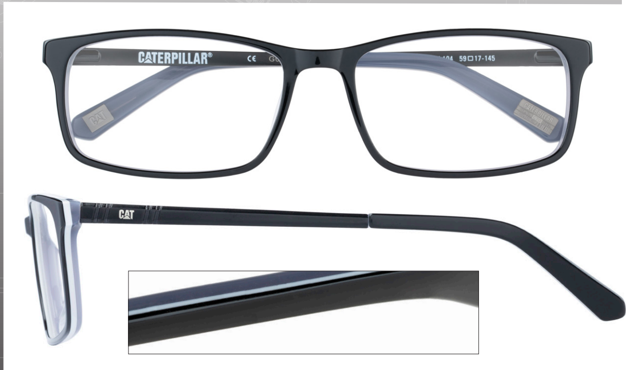
CTO-SCHEDULER-104 Gloss black / Gloss black, white and grey layered