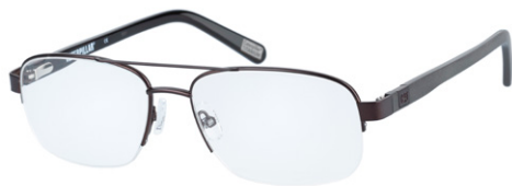
CTO-GLAZER-003 Matte brown / Matte brown carbon and gloss brown crystal