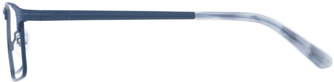
CTO-GAFFER-006 Rubberised matte navy / Gloss grey horn