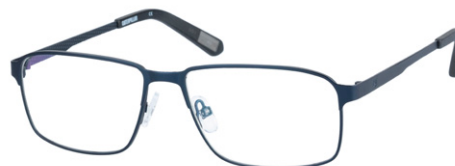
CTO-ARCHITECT-006 Matte navy / Matte black